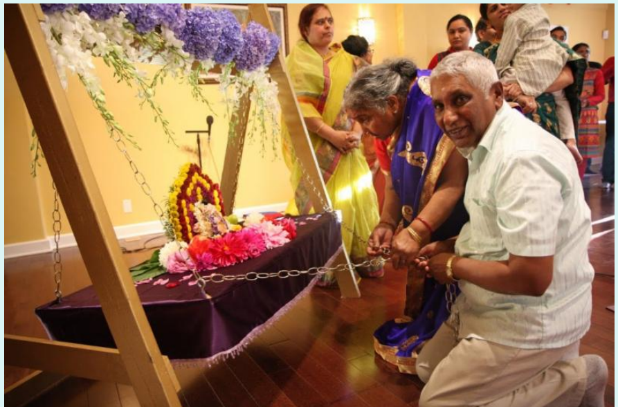
Jhulan (swing) for the Lord