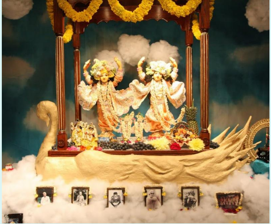
Beautiful darshan of the Lord!