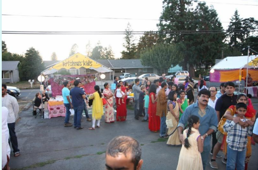
Various booths for Kids' Activities, Yoga, Books & Gift items