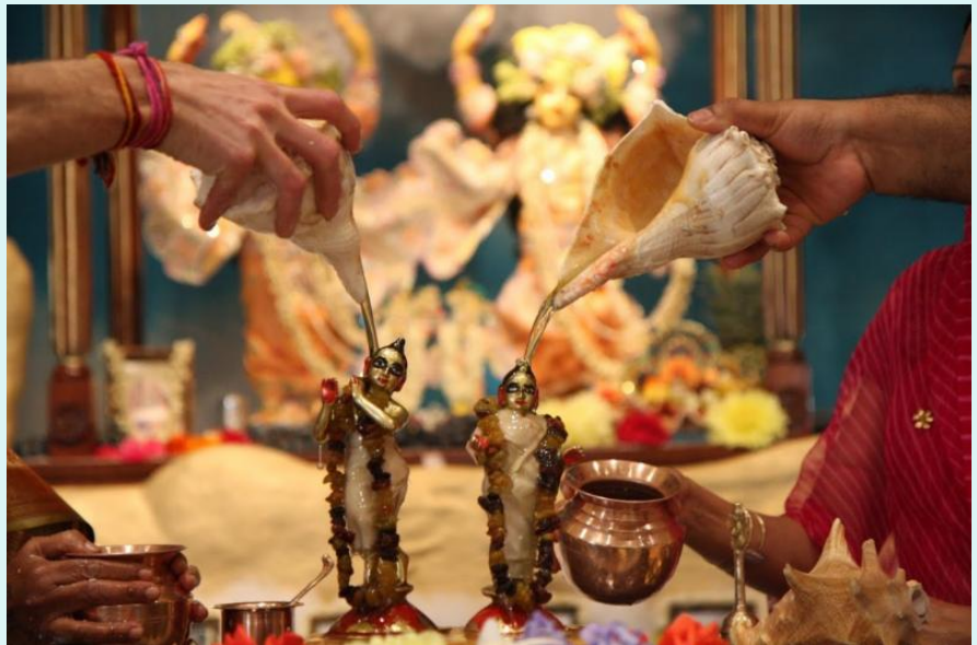
Abhishek of Sri Sri Radha and Krishna Deities